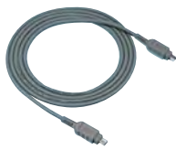
VMC-IL4408A/IL4415/IL4435 (4-pin to 4-pin, 0.8 m/1.5 m/3.5 m) i.LINK Cable