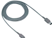
VMC-IL4615/IL4635 (4-pin to 6-pin, 1.5 m/3.5 m) i.LINK Cable