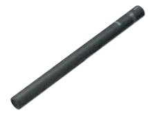
ECM-670/672/678 Electret Condenser Microphone (CAC-12 Camera Microphone Holder is required)