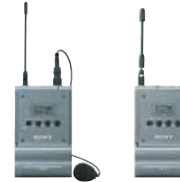
UWP-C1 UHF Synthesized Wireless Microphone Package