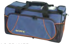
LC-PD150BP Soft Carrying Case for DSR-PD170/PD170P