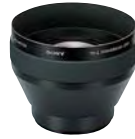
VCL-HG1758 Tele Conversion Lens 1.7x