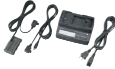
AC-V700A AC Adaptor/Charger