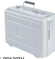
LC-PD170TH Hard Carrying Case for DSR-PD170/PD170P