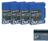
PDVM-12ME/22ME/32ME/40ME Digital Videocassette (Mini size)