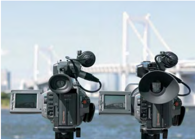
Comparison of images displayed on the LCD monitors of the DSR-PD150 on the left and DSR-PD170 on the right

The DSR-PD170 has a high-resolution color LCD monitor for viewing the recorded picture, or checking the playback picture on location. With its large screen, it is also helpful in setting menus or the audio recording level, as well as monitoring the camera and audio status while mounted on a tripod. The hybrid LCD monitor combines the characteristics of both transmissive and reflective LCD panels. The transmissive LCD panel is suited for dark conditions such as in the studio, while the reflective LCD panel provides clear viewing in bright conditions such as under strong sunlight.