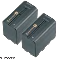
2NP-F970 InfoLITHIUM Rechargeable Battery Pack

Some of the following accessories may not be available in certain countries. For details, please contact your nearest Sony office.